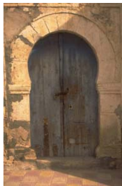
More Old World Sights when cruising Europe.

mor. There are even weekly kids and sometimes family talent shows. Of course these ships have the only aqua shows. Dining also runs the range from simple fast food type items to the chef's table and of course a cruise staple room service. Because of the ship's size there are many options for sleeping accommodations. Inside to suites that overlook the aqua theater and even huge suites great for family reunions. Lots to offer for everyone.