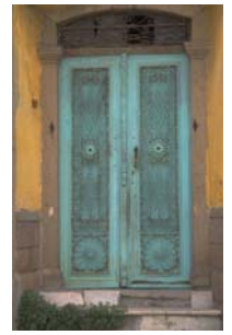
Find neat doorways while walking thru Old San Juan.

For those looking for a North African vacation, Morocco provides an alternative, although without the pyramids. For now most recommend deferring visits to Egypt until things settle and travel there is once again safe for tourists.