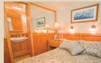
Mariner Staterooms C1, C2, C3, C4 and C6

Features queen bed, view window and private bath with shower.