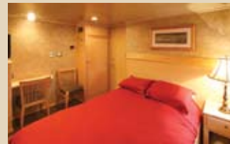
Commander Stateroom B2

Feature king, queen, or twin beds, a large sliding glass door opening to a small balcony and private bath with shower.