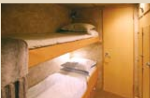
Single Stateroom B1

Feature king, queen, or twin beds, elevated port lights (not suitable for viewing) and private bath with shower.