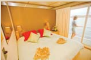
Captain Staterooms A1, A2, A3 and A4

Feature king, queen, or twin beds, a large sliding glass door opening to a small balcony and private bath with shower.